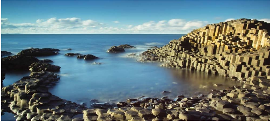
The Giant's Causeway, Co Antrim